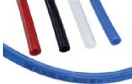
1 Blue, red, black or translucent polyurethane