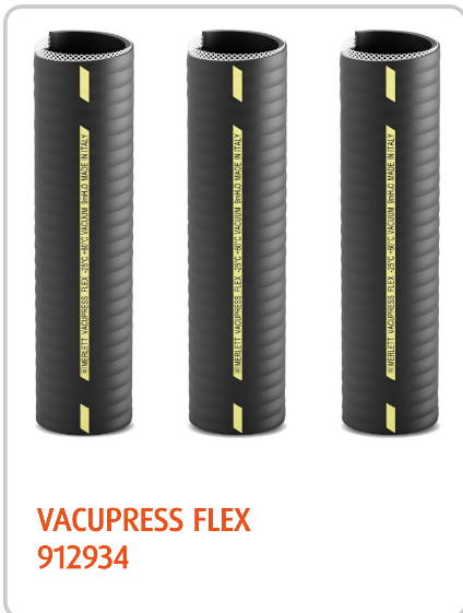
VACUPRESS FLEX 912934